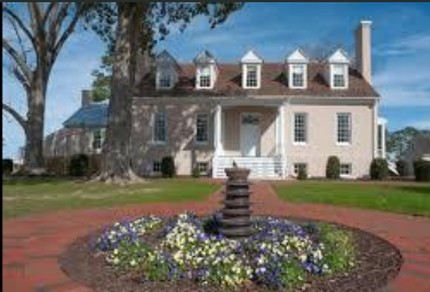
Magnolia Grange Chester, VA